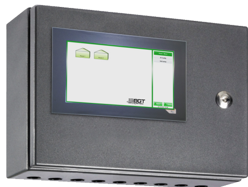
LED Light Controller