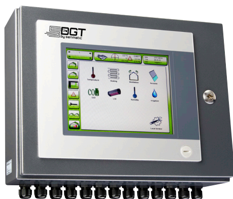
LCC4 Climate Control

You are welcome to ask for the specific product sheets for both the LCC 4 and LED Light controller. You can also find further information on our website.